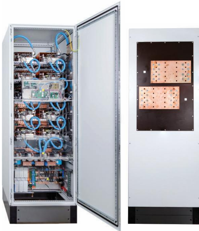
POWER STATION pe5910-W, front view - example

Water cooled DC power supply in switch mode technology, designed for the direct installation at the electroplating tank with minimized floor space.