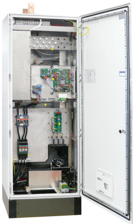
POWER STATION pe5210-W, front view, example with 60V / 800A

Water cooled DC power supply in switch mode technology, designed for the direct installation at the electroplating tank.