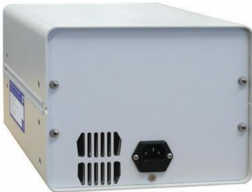
POWER STATION pe1018-2-SNT, back view