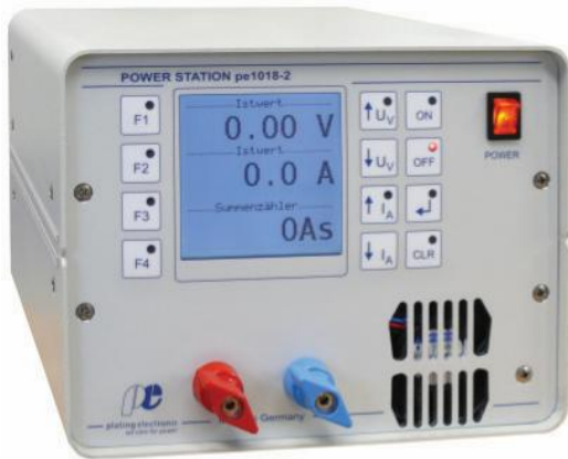
POWER STATION pe1018-2-SNT, front view

DC power supply in switch mode technology, designed for use in electroplating.